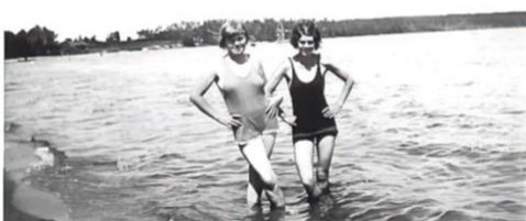
Two Young Women on the Beach at South

In 1903 O. E. Warner opened a store on the north side of the mouth of the Turtle River at South Bay. Over the next 30 years he developed a resort, pavilion, dance hall, campground and hosted many events. These included boat tours, nightly dances most July nights, sports days, and boat tours. Every summer featured a rodeo and travelling Big Tent Religious Revivals. This a restored and coloured photo of the "Pioneer" a touring and fishing boat operated by Warner in the 1920s.